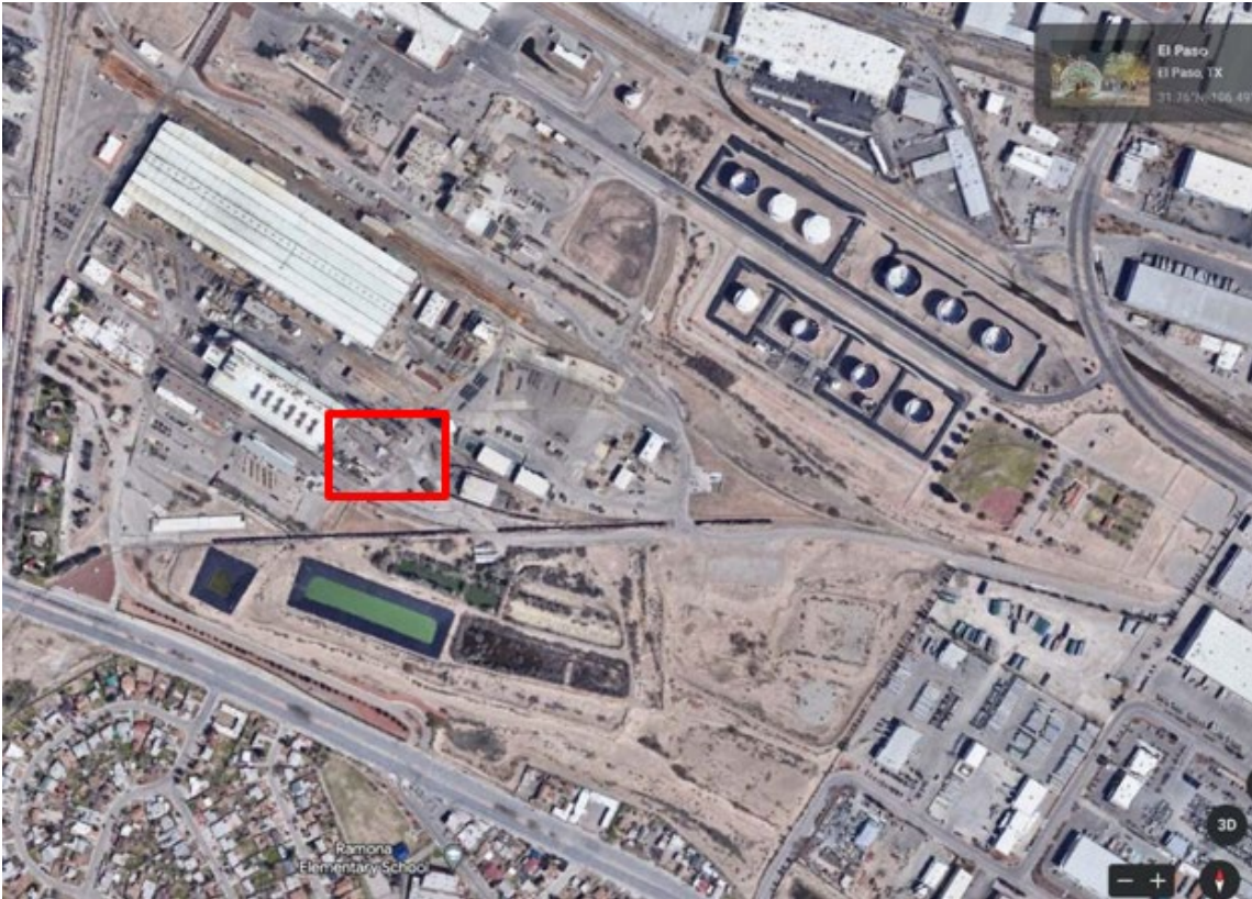
Figure A-1. Site of the Freeport-McMoRan Copper Refinery and Rod Mill, El Paso, Texas. Red box indicates the location of the refinery.