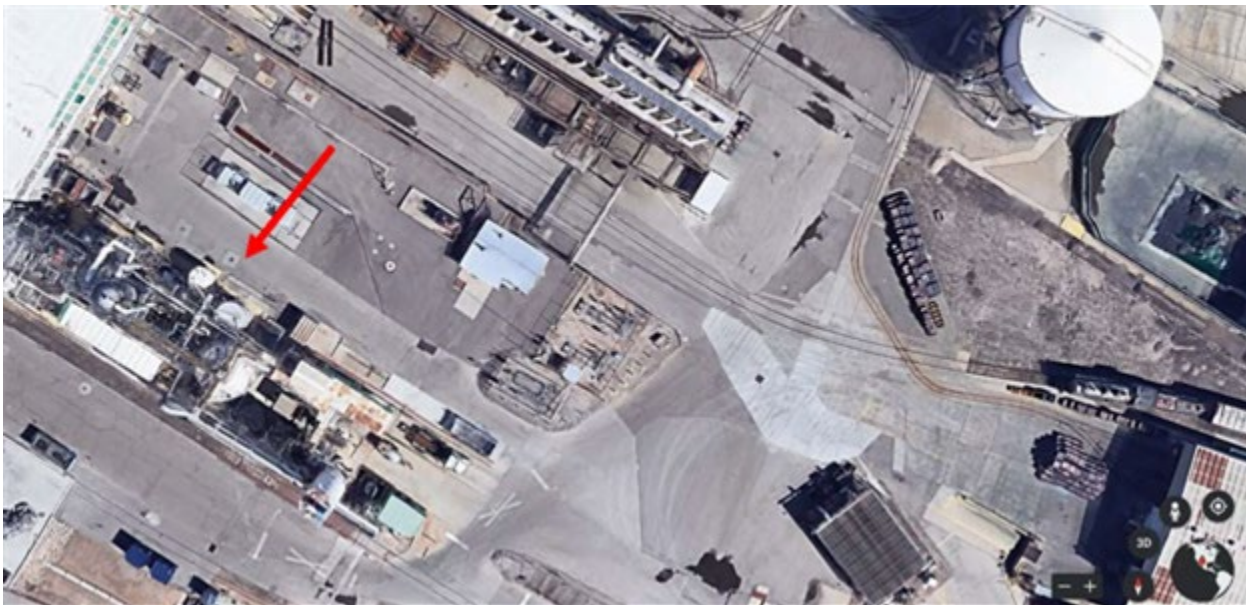
Figure A-2. Enlarged view of red-boxed area in Figure A-1 showing Freeport-McMoRan Copper Refinery and Rod Mill Water Recovery Plant (WRP) (indicated by red arrow, left).